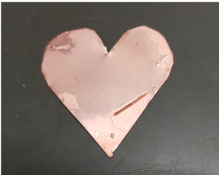
The purified heart