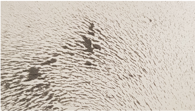
Field lines on the cardboard