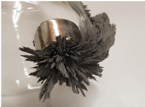
Magnet in a beaker, iron filings form wonderful shapes on the outside